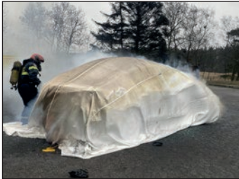
Water mist lance set